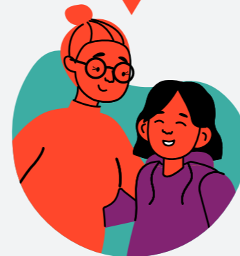
Connection to community and whānau